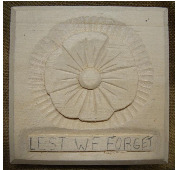
A close up of one of Barney's (soon to be painted) tiles...