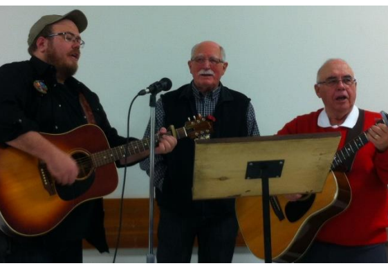
Some more pictures from the Christmas Potluck...