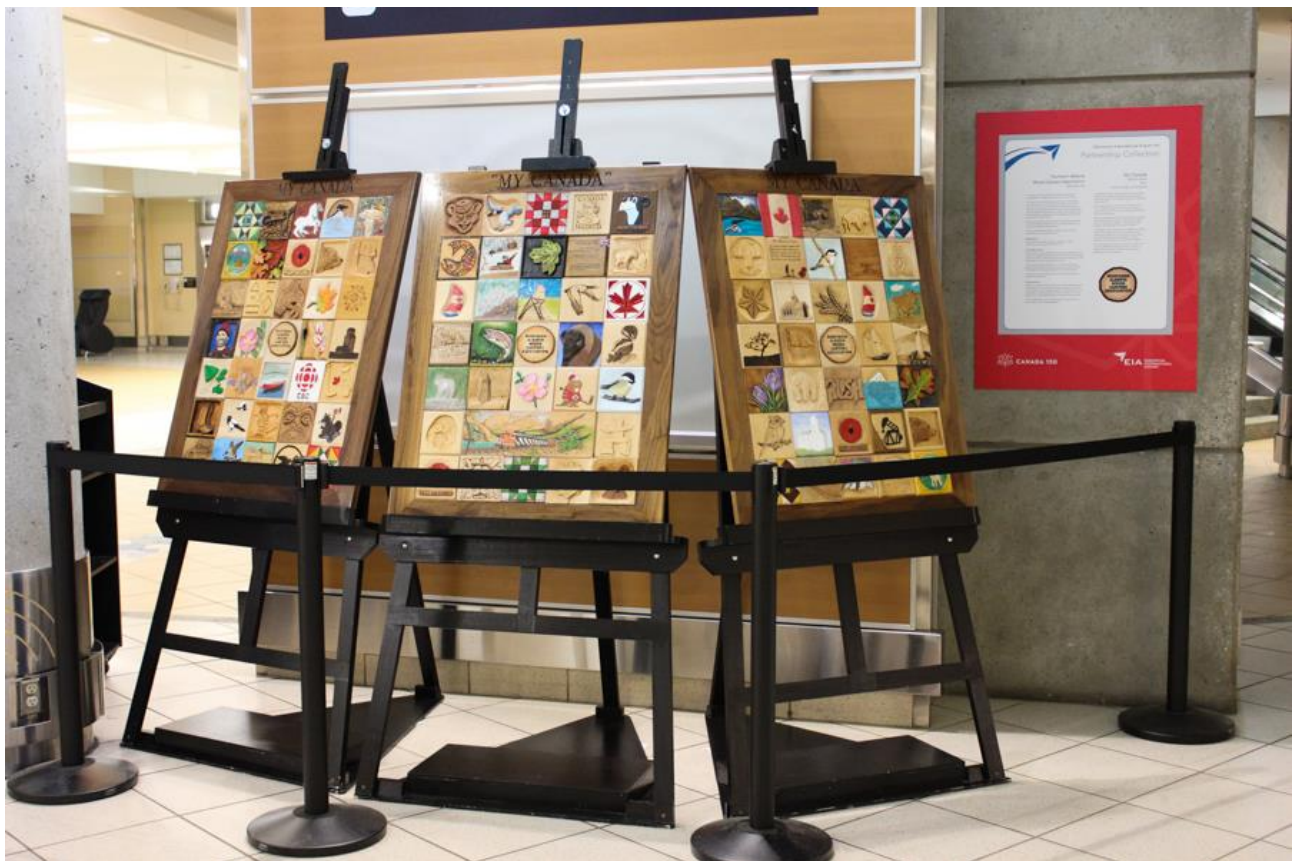
At the Edmonton International Airport in July/August.